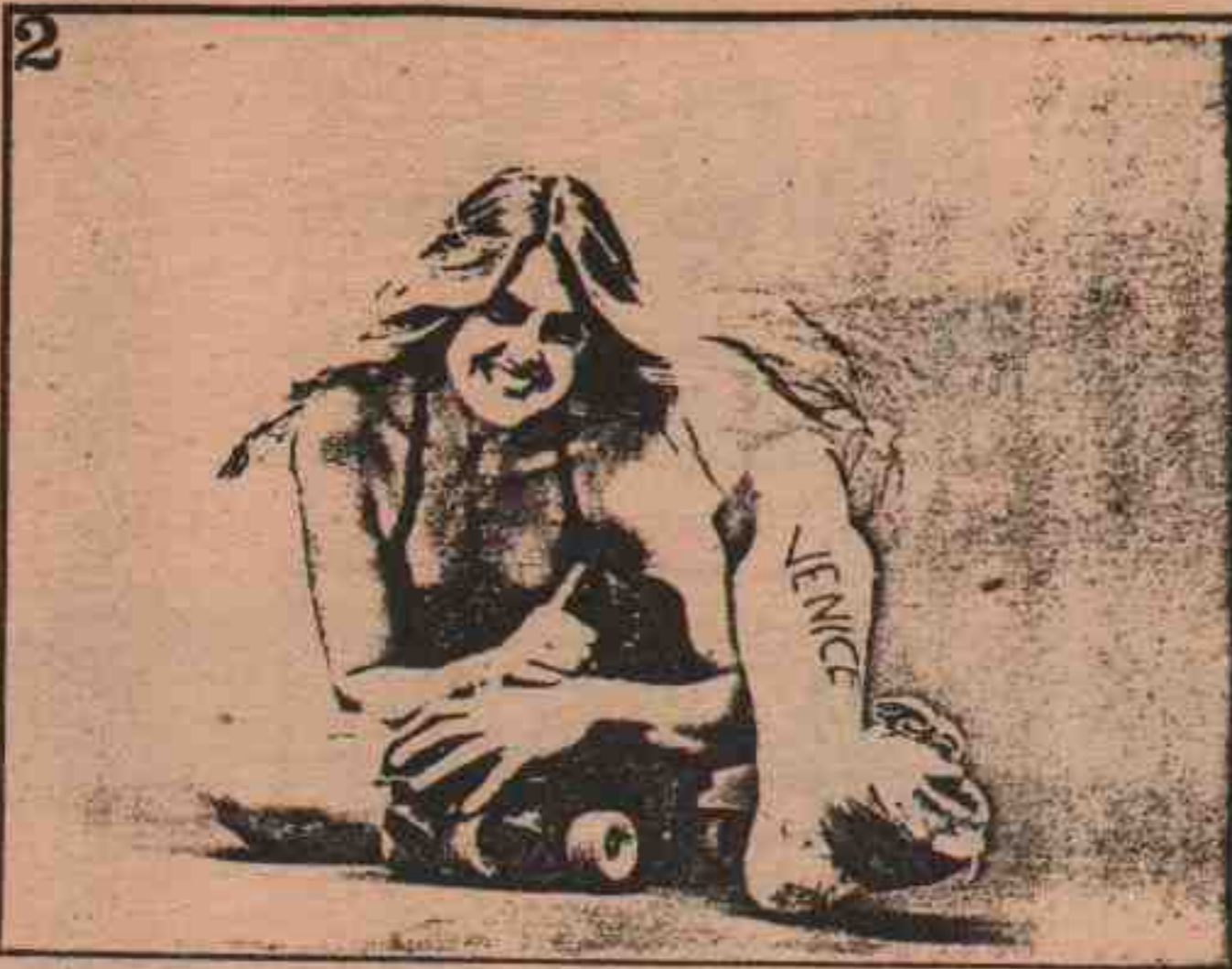
happy birthday, Venice! 75! and wheel crazy in 1980!