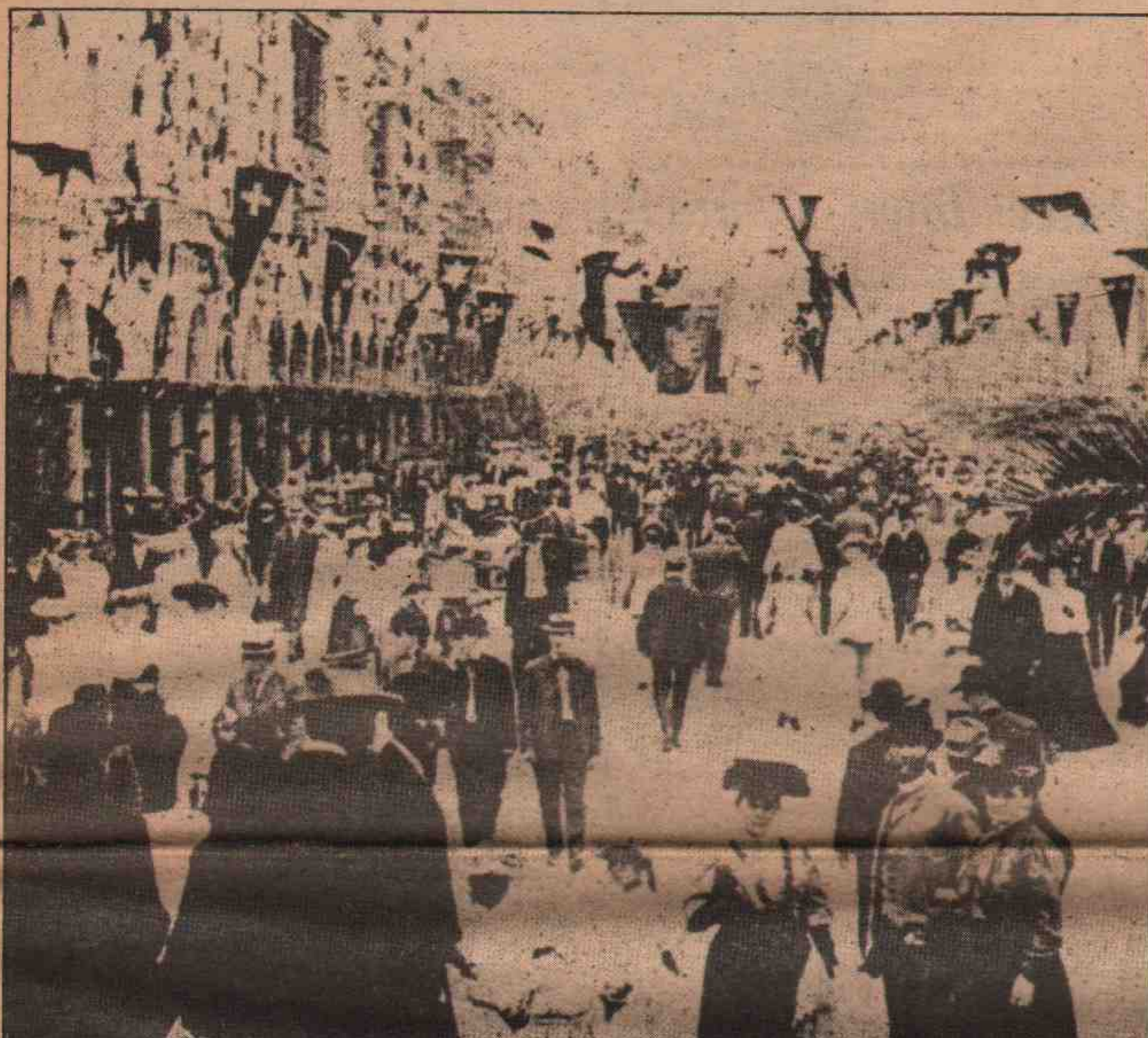
Old newspaper photo of Windward Avenue, 1905

OCTOBER 1980 ISSUE NO. 130 P.O. BOX 504 VENICE, CALIFORNIA 90291 823-5092