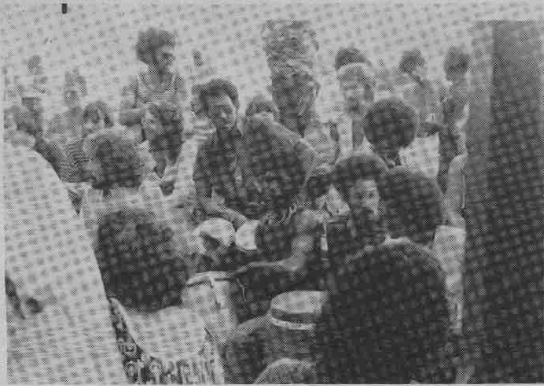
CONGO DRUMMERS AT BEACH