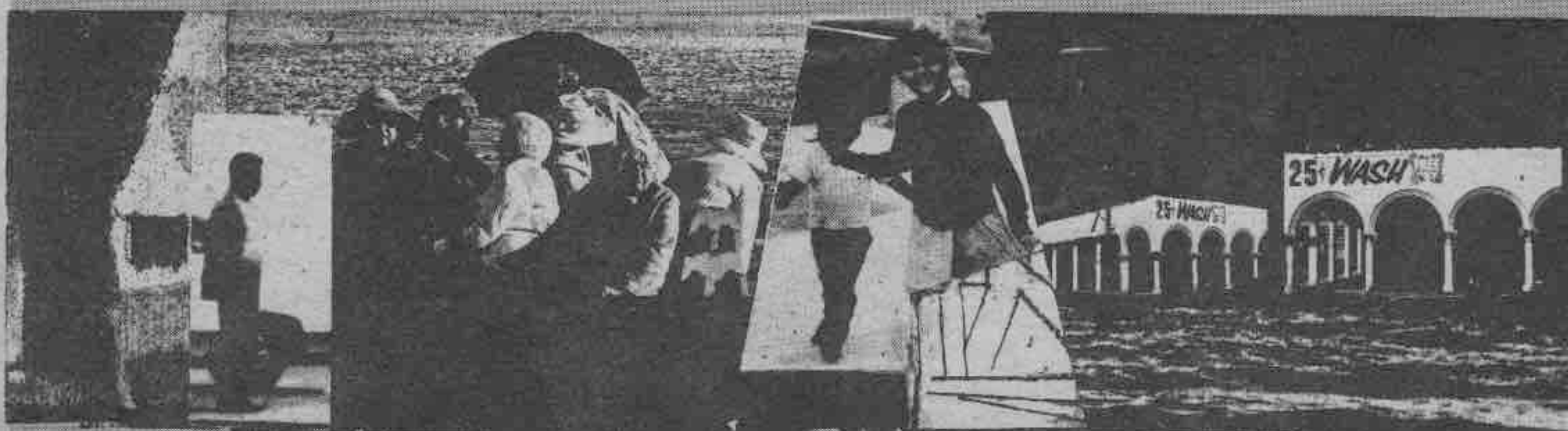
SUMMER FESTIVAL JUNE 17 & 18 The Venice Community is hosting a planning event.