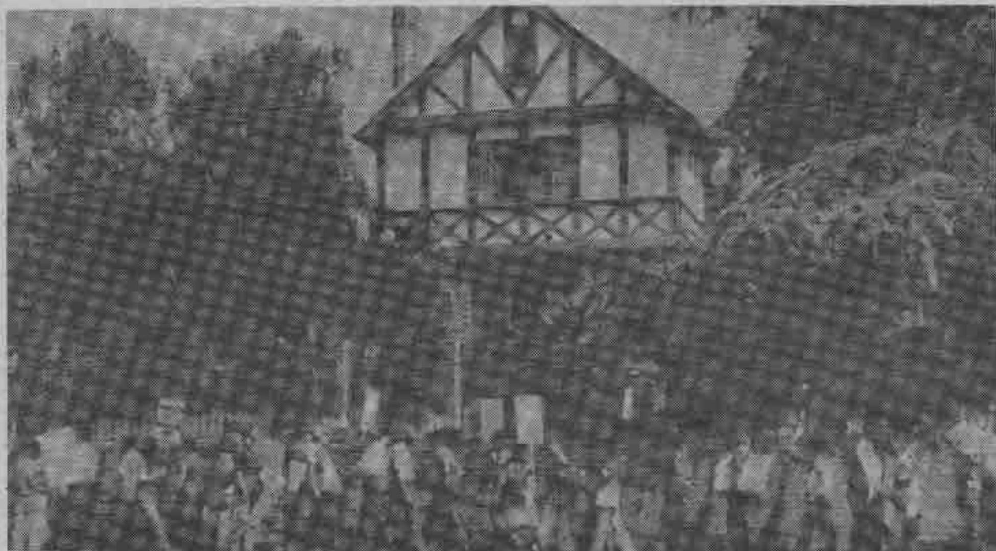
"CERTAINLY NOT EAST L.A.," one of the pickets at the home of Romana Banuelos was heard to comment last Saturday as employees of Ramona's Mexican Food Products, Inc., and sympathizers totaling 125 walked the sidewalks fronting the Treasurer of the United States' mansion