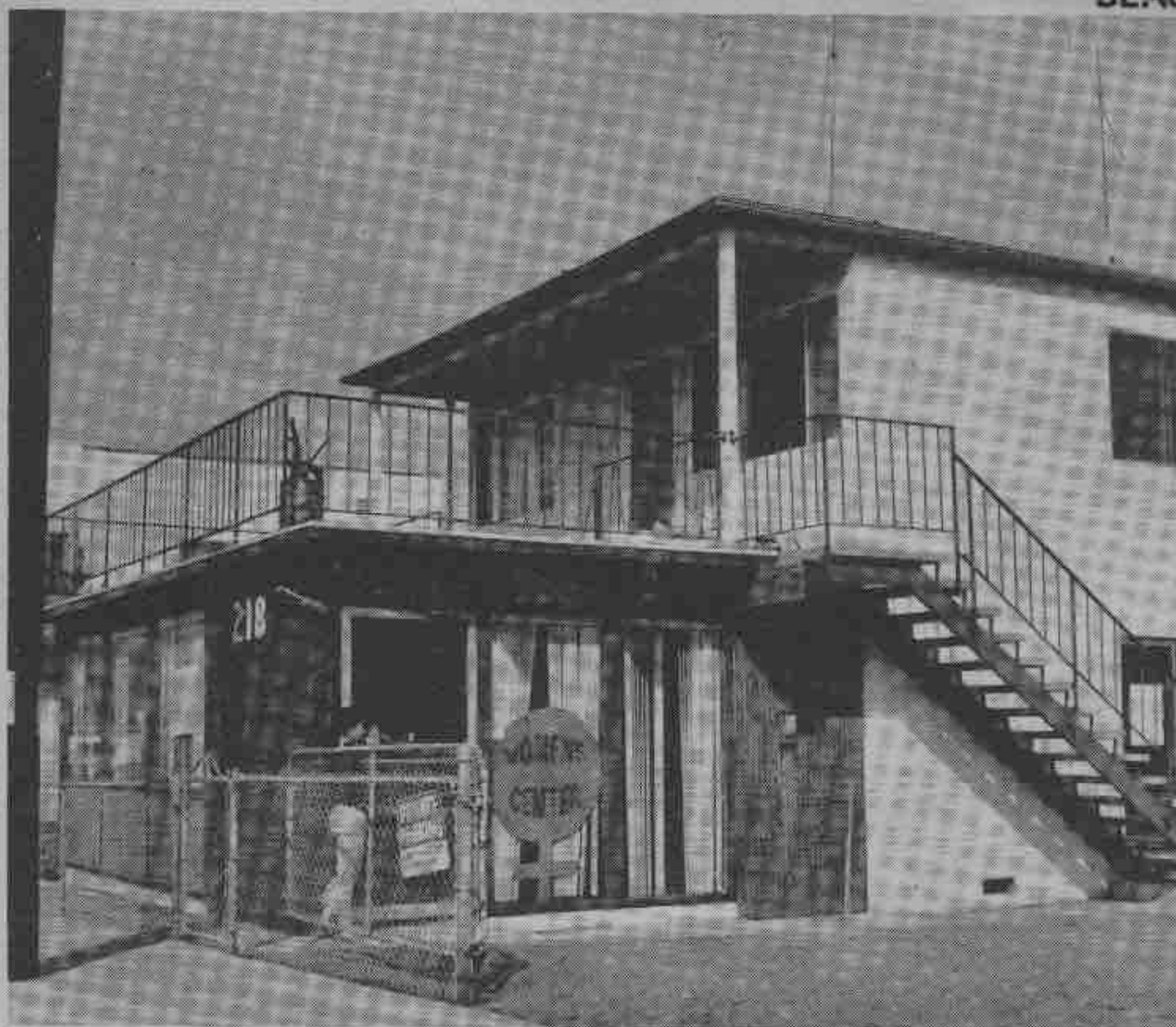
The Venice Woman's Center, 218 Venice Blvd. East. To get there, take Pacific Ave. to Venice Blvd. East. See Woman's Center Article, PAGE 8.

8:00 PM Venice/SM Peace and Freedom Club meeting, 1727 W. Washington Blvd. 821-6101