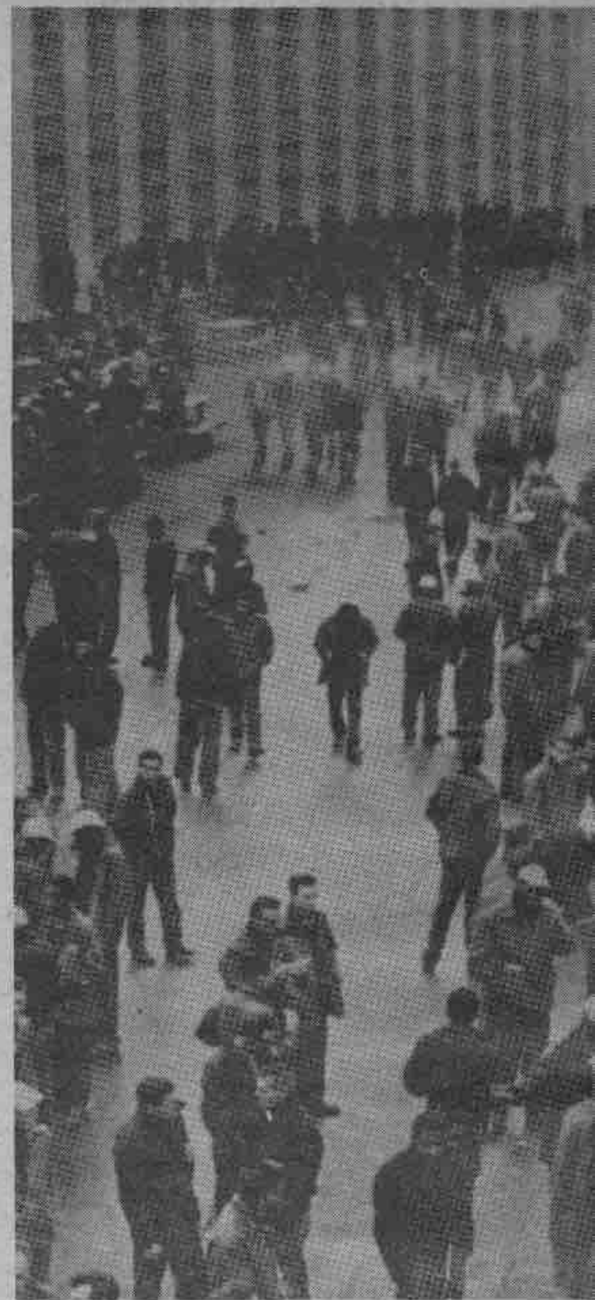
Yard at California Reha

Women and the War is a group of Women who have been in the Women's Liberation Movement who are trying to reach women concerning the connection between the fight for Women's liberation and the fight to end the war in Indochina. They are considering a possible consumer's boycott of one of the corporations engaged in war production. People interested should call the Women's Center, 937-3964 and leave a message.