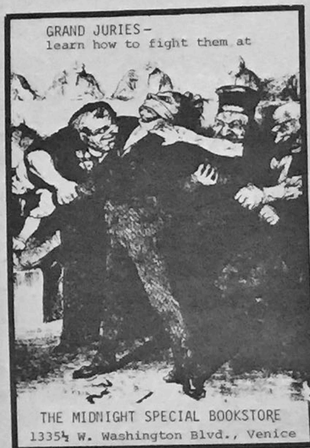
GRAND JURIES - learn how to fight them at