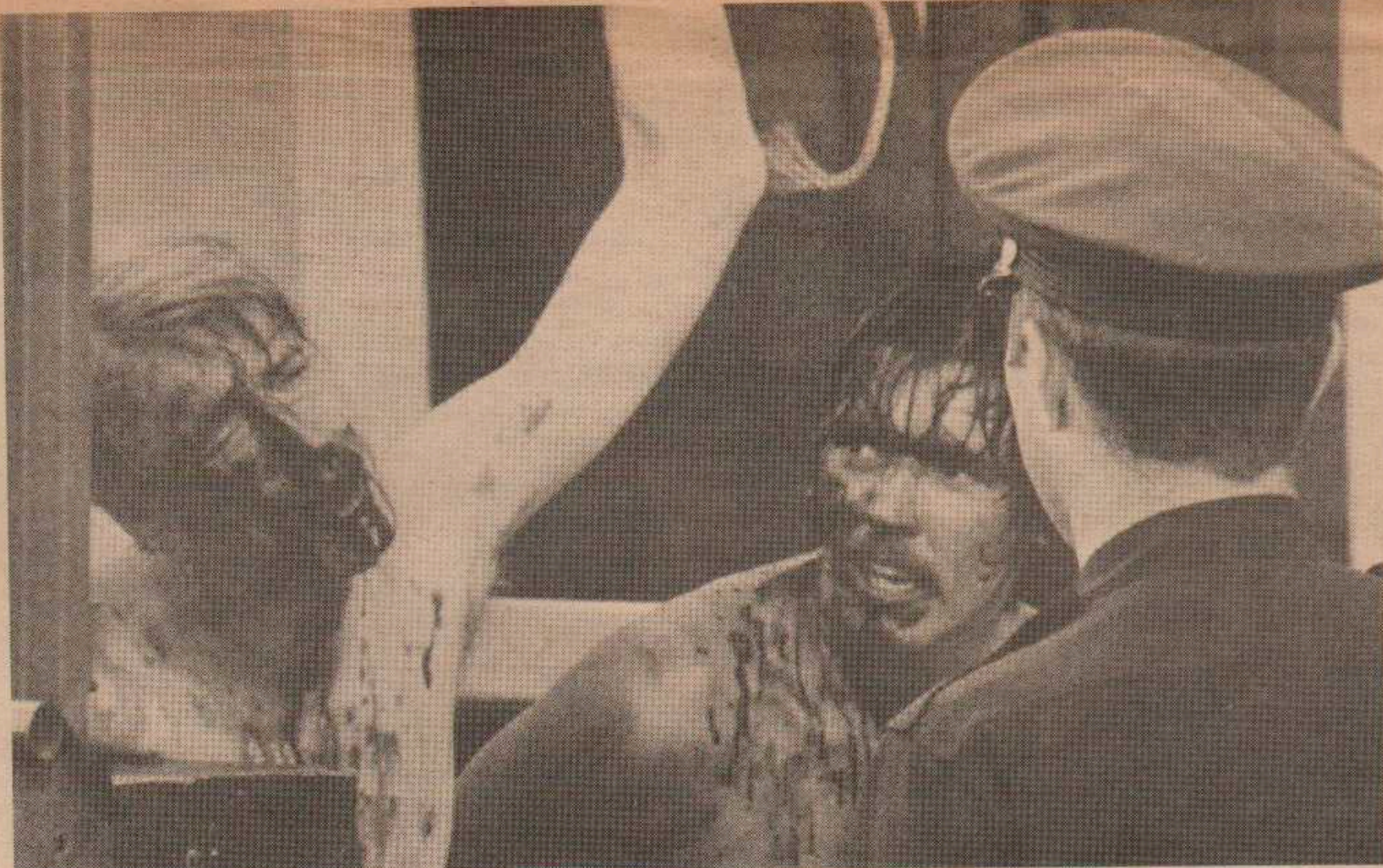
Victims of L.A. police riot on Venice beach, April 20th.

Signed articles in BEACHHEAD are entirely the work of individual writers and do not necessarily reflect the views of the BEACHHEAD staff. The staff is open to any Venice resident who wishes to contribute time and effort to produce and distribute the paper. Contents of each issue are decided collectively by the staff for that issue. The paper is non-profit in that all money contributed is used to cover the costs of production and distribution. Each issue of the paper is delivered free to 10,000 Venice residents. Your copy cost us about 2 cents and hours of volunteer labor. If you want this unique community paper to continue, please offer your help by calling 399-7681, or send a check to BEACHHEAD 1727 W. Washington. The FREE VENICE BEACHHEAD is published at 1727 W. Washington Blvd., Venice, California 90291. Telephone: 399-7681. Circulation this issue: 10,000 copies. Copyright 1969.