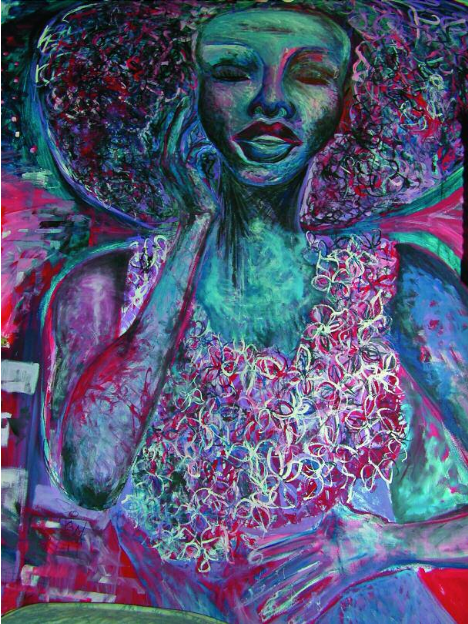
Painting by Mimi Bogale

“Your Local Shop for Scrumptious Food and Sinful Chocolates”