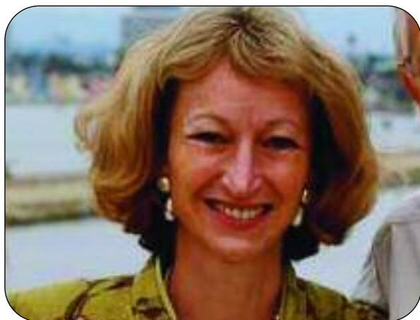
Debra Bowen California Secretary of State