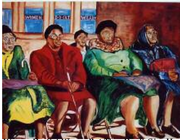
Women Do Get Weary, But They Don't Give Up