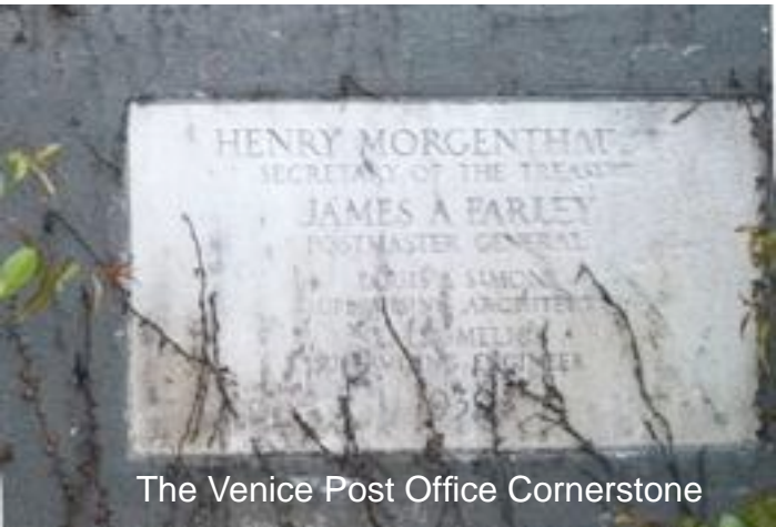
The Venice Post Office Cornerstone

The Venice Post Office could make some more income if it would run, or contract for, a coffee and croissant bar in the far end of the lobby. The post office is one of the main places where Venetians meet their neighbors and friends. It would be nice, and good PR for the post office, to provide a place to sit and have coffee. The host could also sell stamps, eliminating one of the main reasons to stand in line. ☺