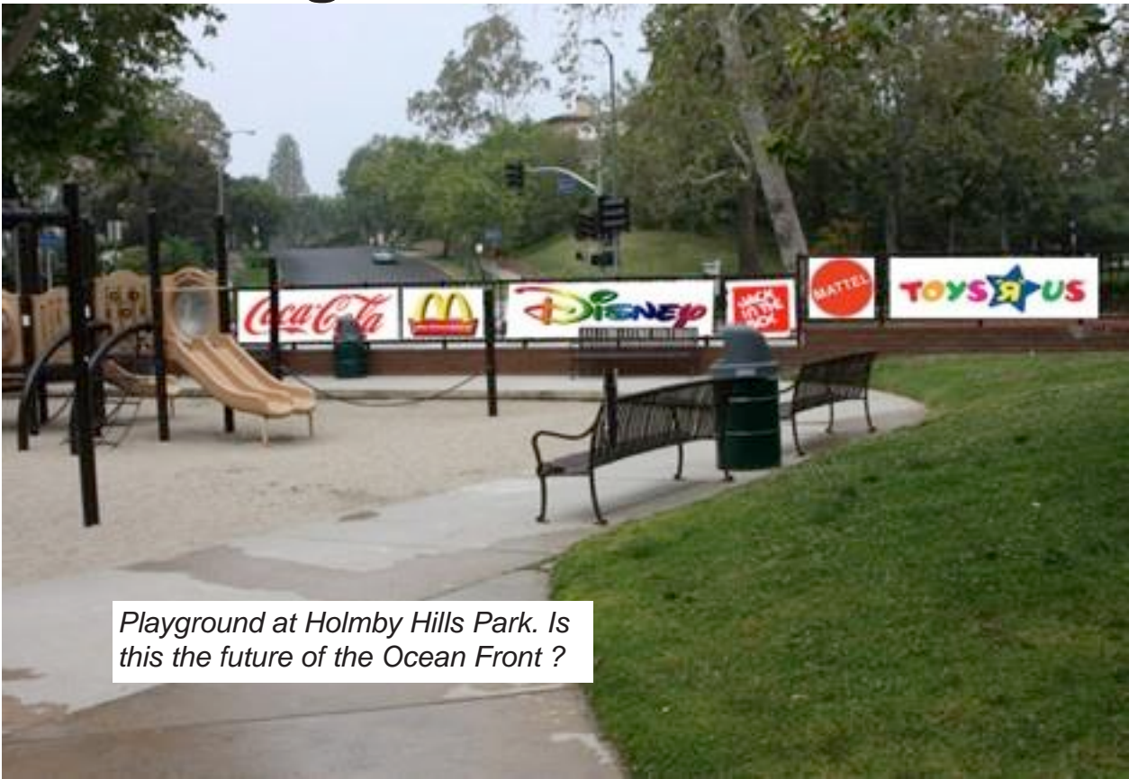
Playground at Holmby Hills Park. Is this the future of the Ocean Front ?