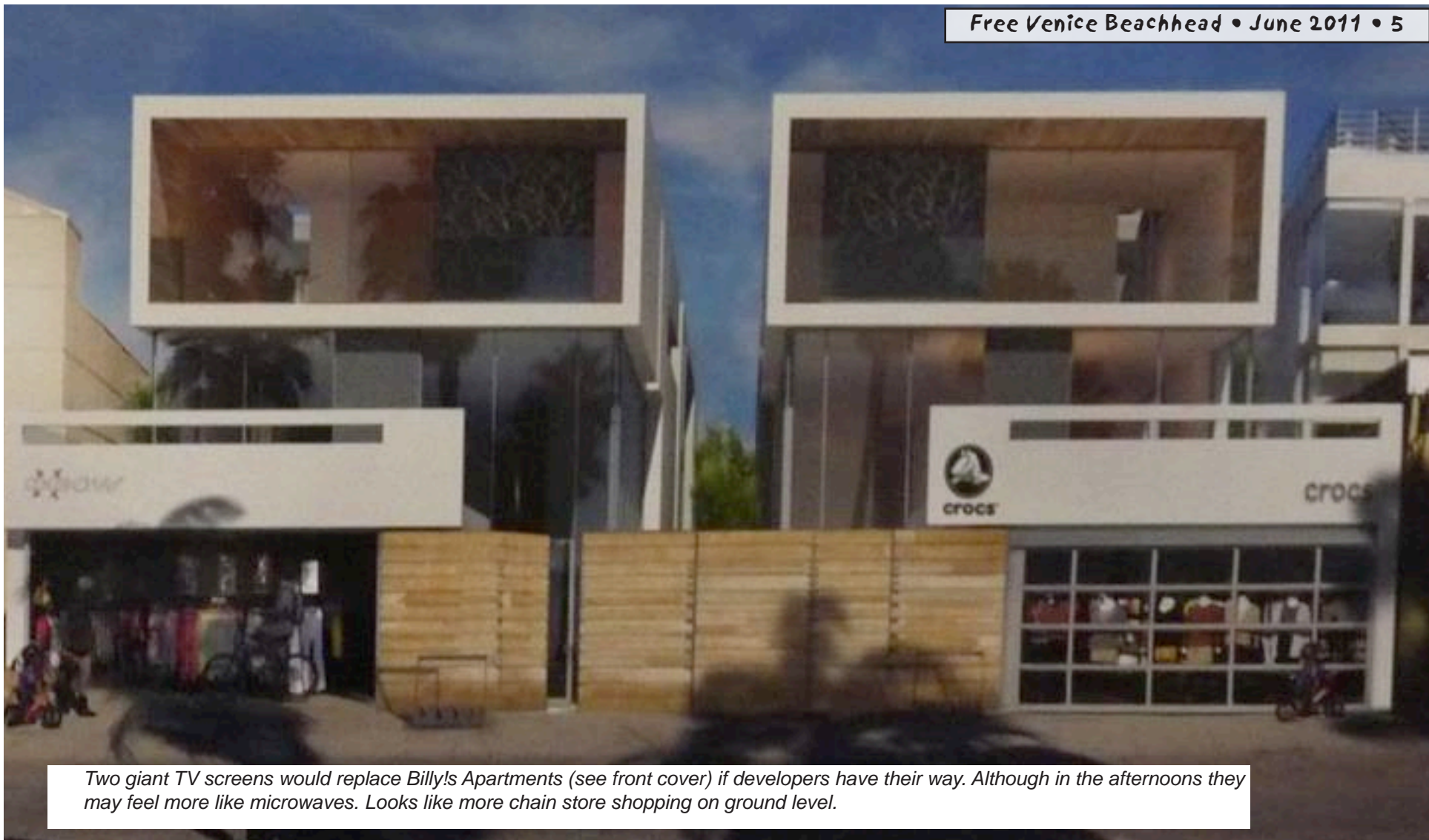
Two giant TV screens would replace Billy's Apartments (see front cover) if developers have their way. Although in the afternoons they may feel more like microwaves. Looks like more chain store shopping on ground level.