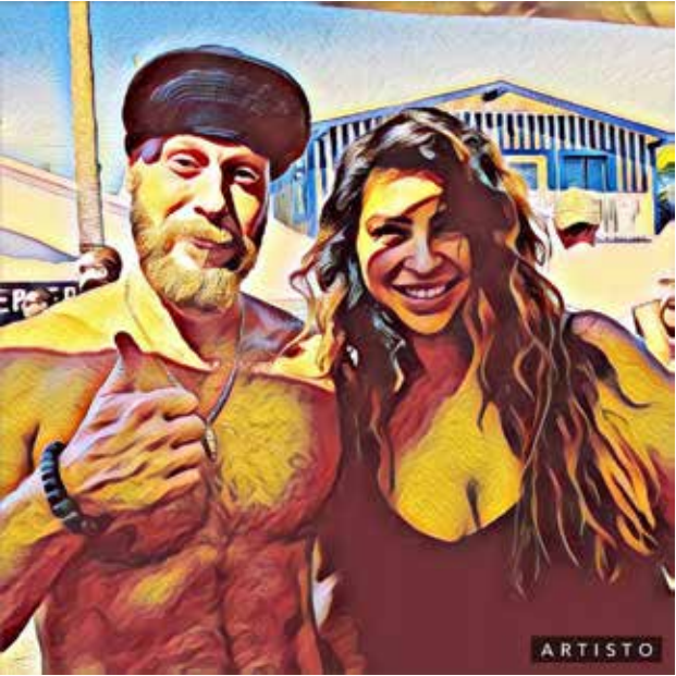
Cute couple eh? Where did I put their names?