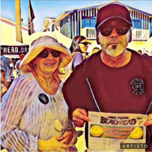
Beachhead Fans, it's so good to see you.