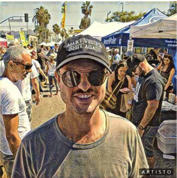
I got one of these hats. Darker than “Keep Venice Funky”, and deeper irony.