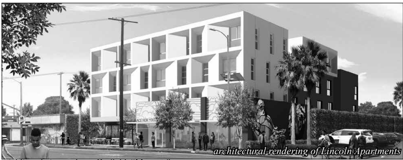
architectural rendering of Lincoln Apartments

One neighbor, speaking on behalf of like-minded Venetians, "Wants to help, but saying yes is irresponsible...safety of 800 kids who go to school (on Garfield)... problem!" Recounts the time a man