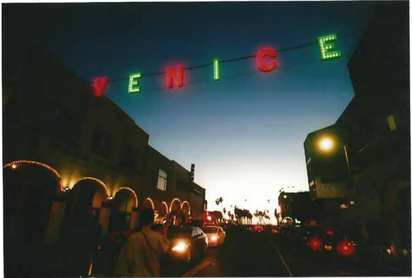
photo of Venice Sign above at night