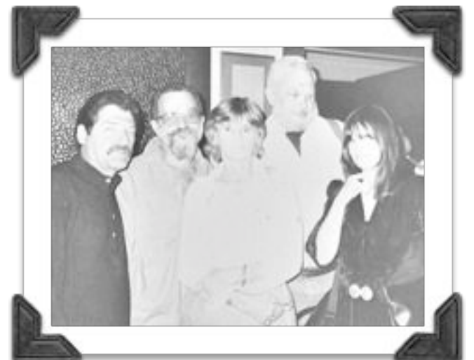
Venice Poets Circa 1988