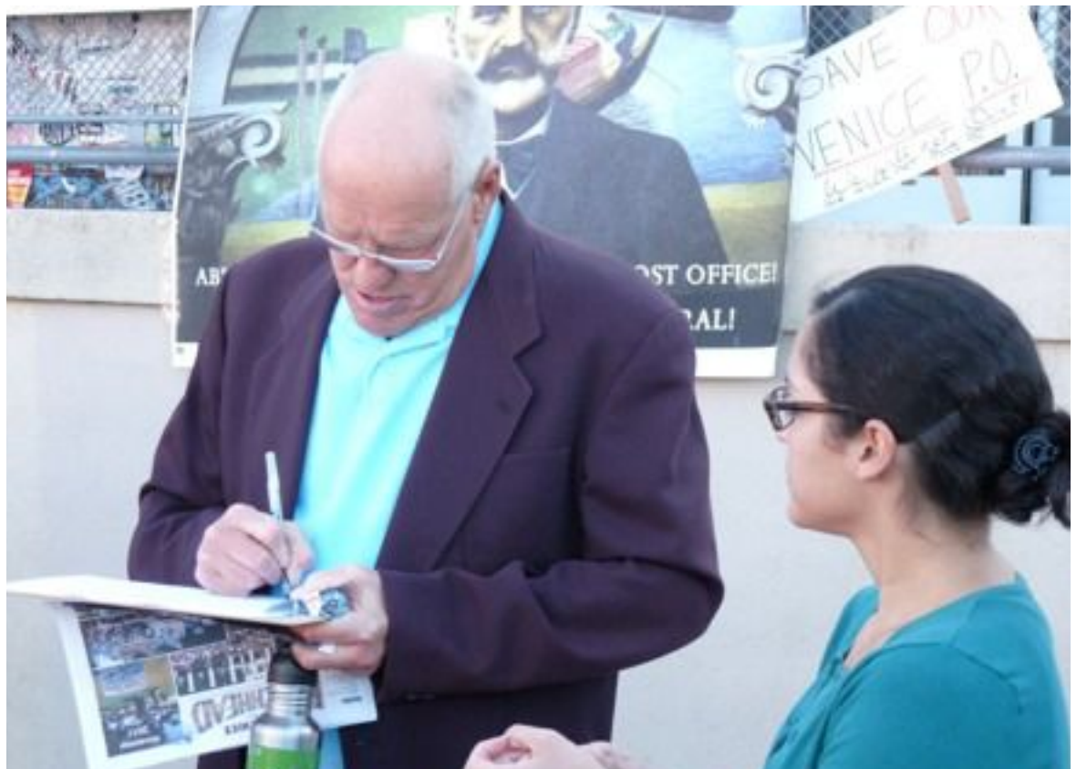
L.A. City Councilmember Bill Rosendahl signs the petition to save the Venice Post Office. He also spoke at the Nov. 5 rally.