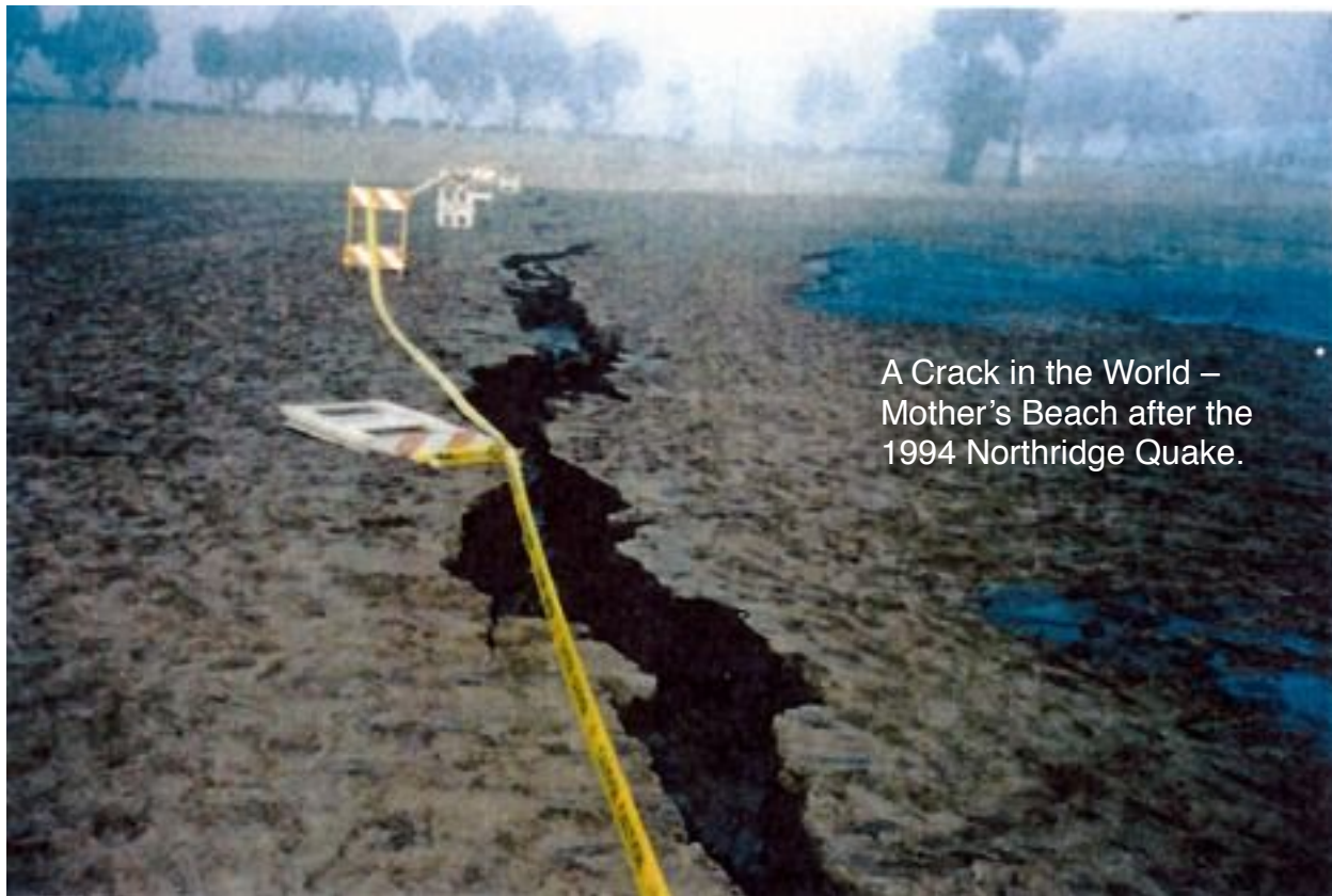
A Crack in the World – Mother's Beach after the 1994 Northridge Quake.

Currently Sempra Energy Corporation, (The Gas Company), is abandoning Del Rey 10 without letting the residents know a potentially dangerous situation may exist, without notifying the County, and without notifying the Governor's Office of Emergency Services if it is the responsible party for the gas release. Sempra was the responsible party for the pipeline