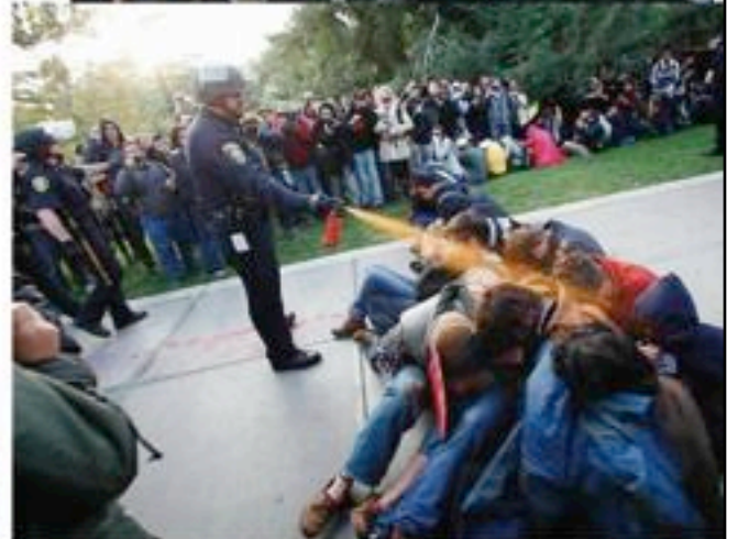
Occupy Portland and Occupy Davis

buildings, and do not leave? What will happen when the police, the National Guard and the army are no longer reliable enforcers of the 1 percent order?