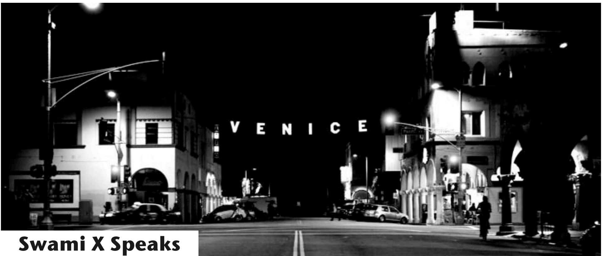
Windward Avenue at Night

Reprinted from the Free Venice Beachhead, Dec. 1973, #48